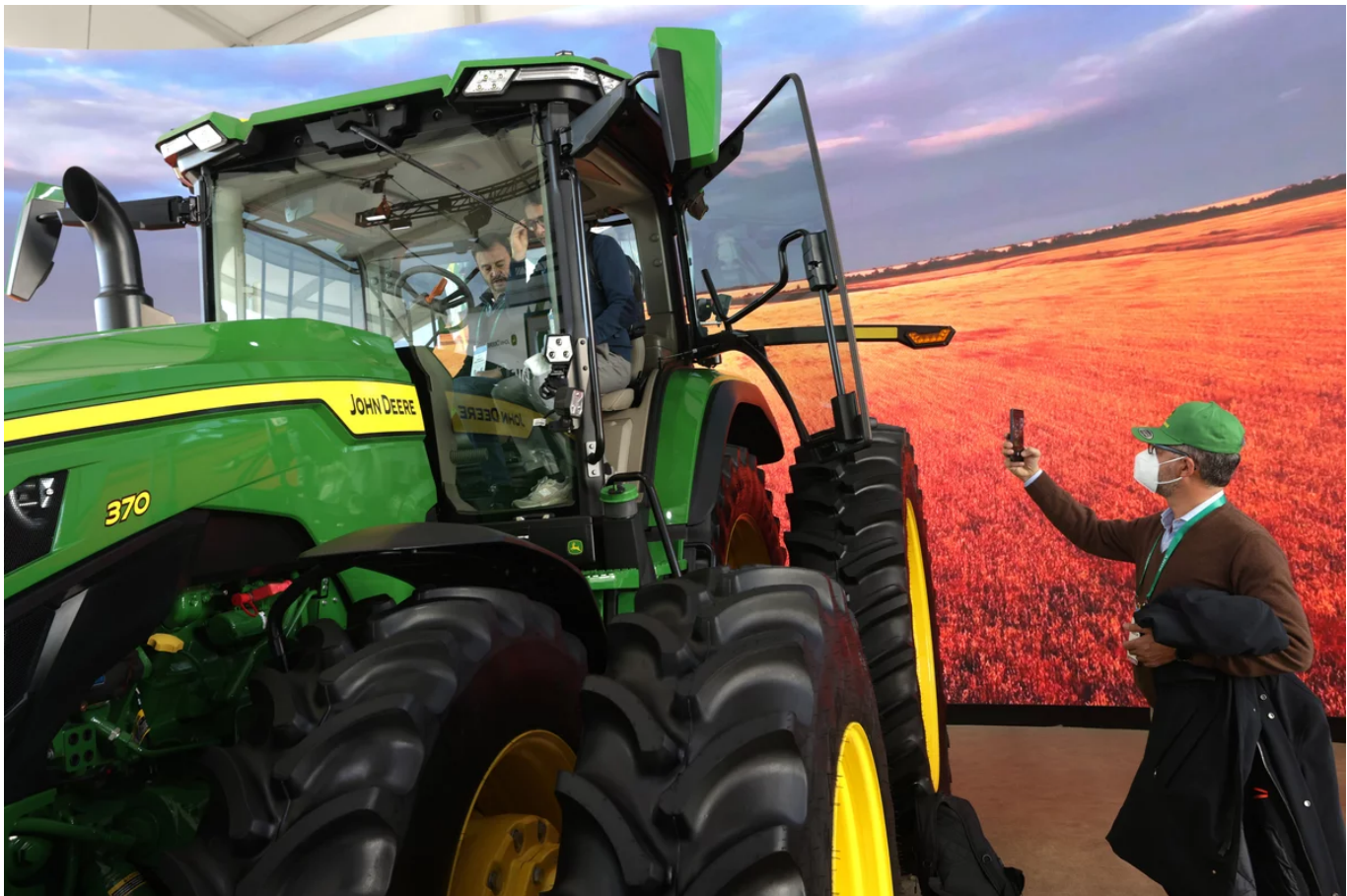
A John Deere autonomous tractor is on display at CES 2022 in Las Vegas, Nevada.