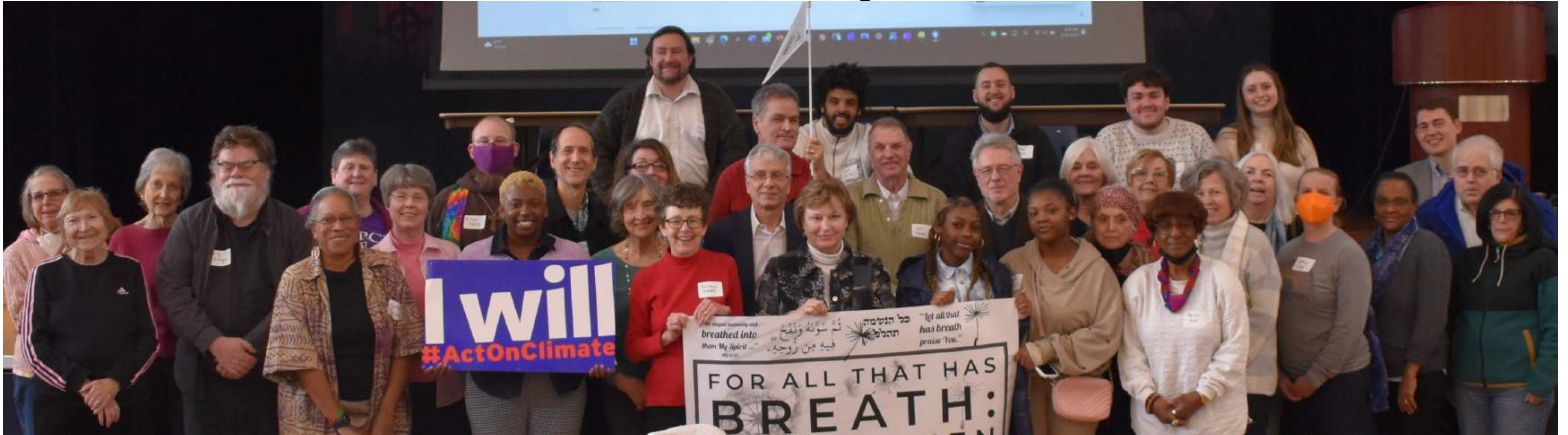
Catholics for Our Common Home gather in Annapolis to speak out in support of the Energy Savings Act

For all that has breath, strengthen EmPOWER