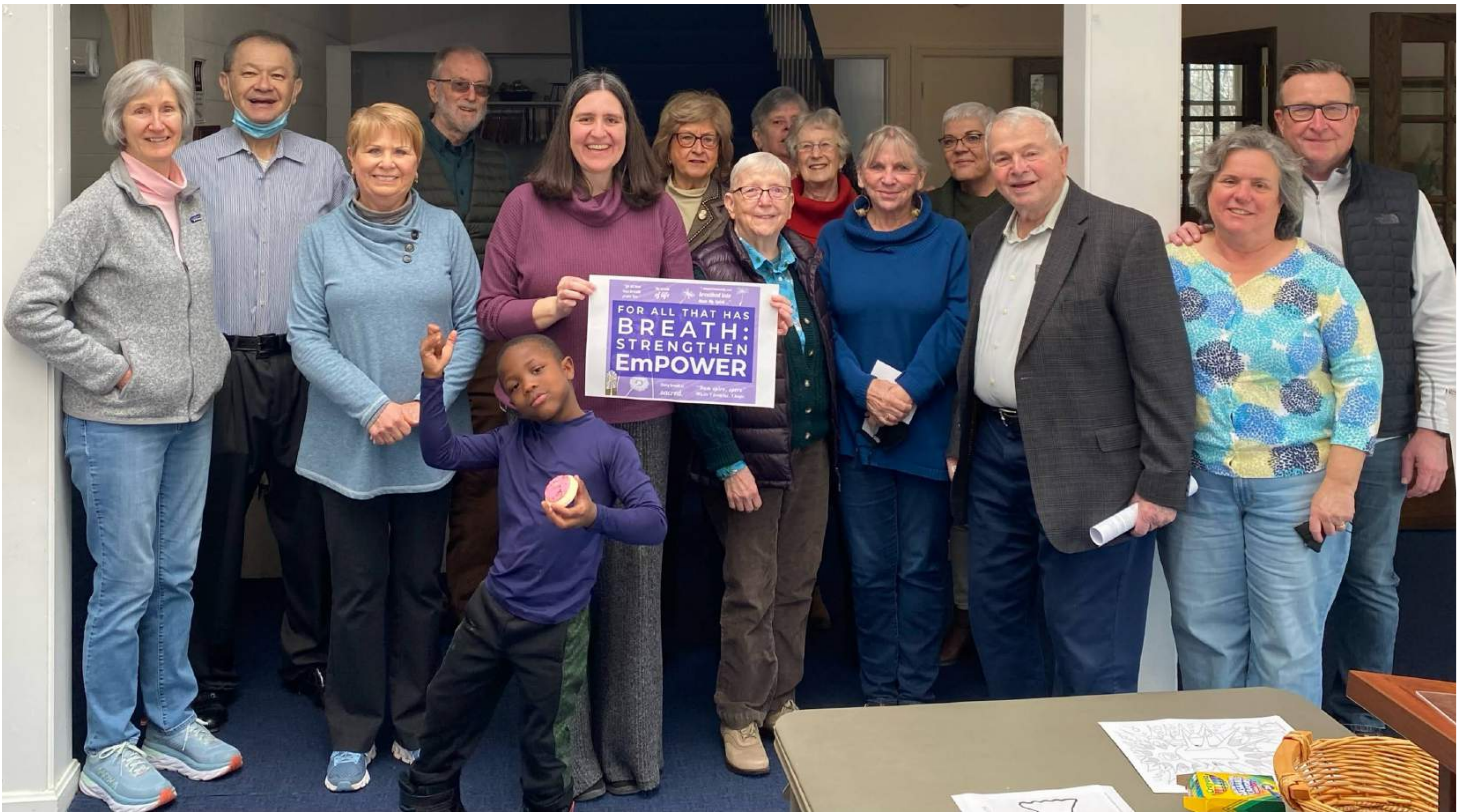
Members of Maryland Presbyterian Church in Baltimore County