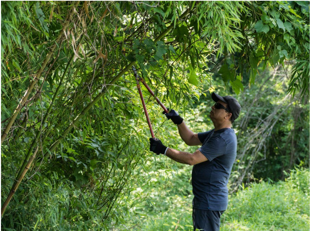
A volunteer trims bamboo at Glen Hills Local Park in Rockville,

by Capital News Service February 2, 2023