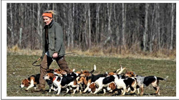
Hills Bridge Beagles