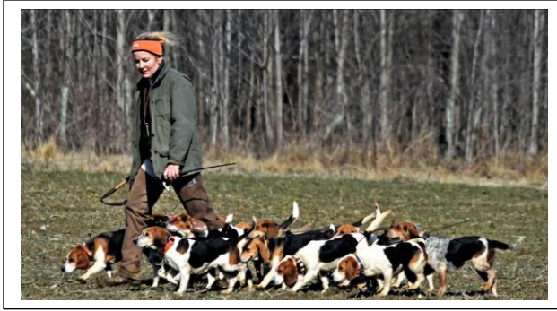
Hills Bridge Beagles