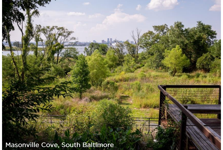
Masonville Cove, South Baltimore

and the U.S. Fish and Wildlife Service. Together, these partners ensure nearby underserved and overburdened communities have access to 70 acres of water, 52 acres of restored wetlands, three miles of walking trails, a LEED rated education center, and a fishing pier. In 2013, Masonville Cove was designated as the nation's first urban wildlife refuge partnership by the U.S. Fish and Wildlife Service.