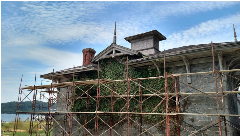
Historic Tome Gas House on Susquehanna River

The Park has energized the town and is considered beneficial to the local community through ecotourism. 1 Community meetings and plans such as an environmental mural are underway.