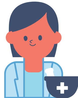
counseling on important health issues