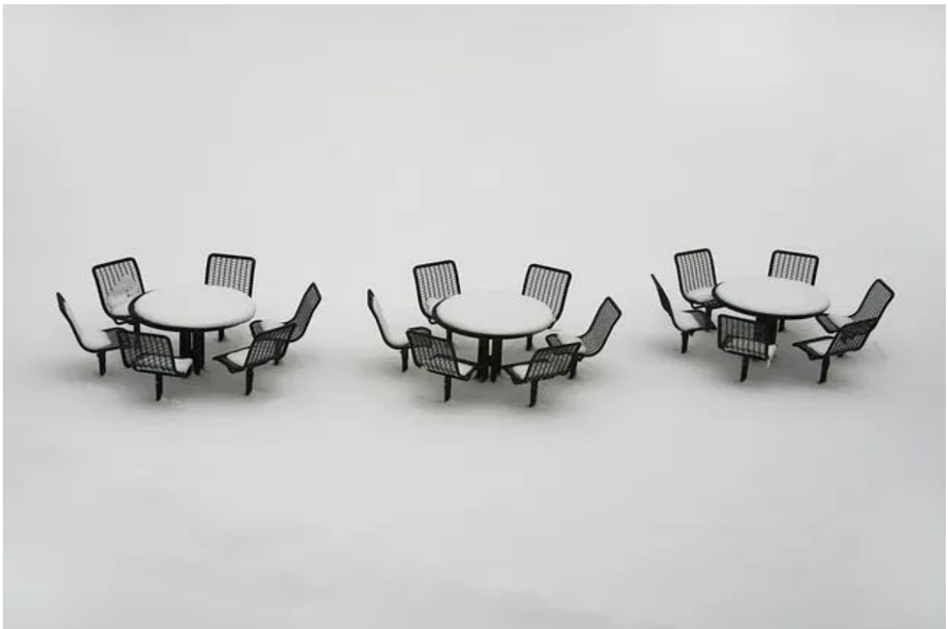
Toronto after a storm.

HOME | WITCH TRIALS | HONESTLY | SUPPORT US | CAREERS | COMMUNITY | ARCH.