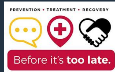
(Opioid Operational Command Center, n.d.)