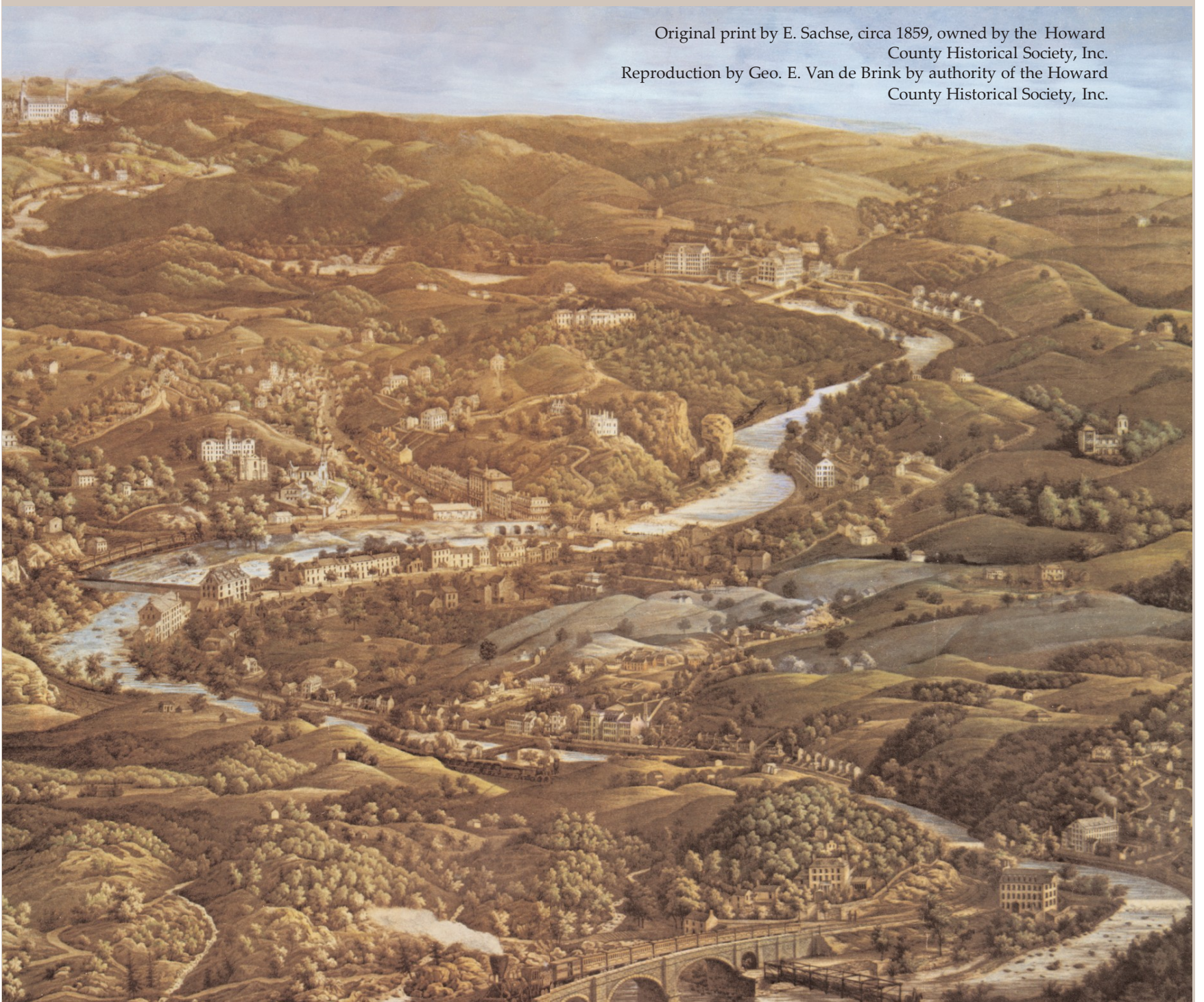
Ellicott's Mills, 1859