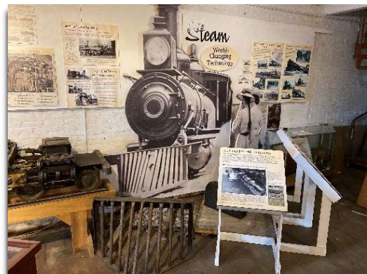
One of the exhibits at the WSRR Museum.