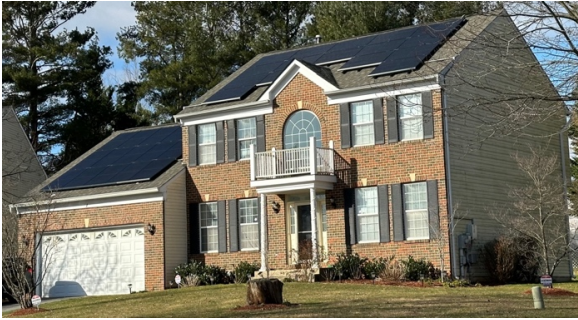
Figure 7. Solar panels which may connect to BESS hidden in garage.