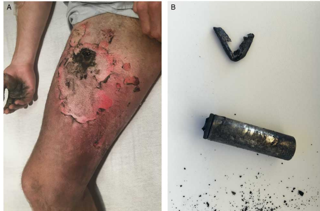
Figure 12. Typical burn injury from vape igniting in pocket shows battery and casing fragment removed from thigh. ( https://www.cambridge.org/core/journals/canadian-journal-of-emergency-medicine/article/burns-associated-with-ecigarette-batteries-a-case-series-and-literature-review/7ED4071739CCAA5CA071BB88EA3C27FC )