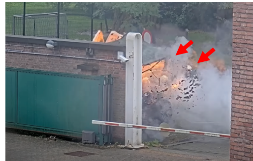
Figure 4. Jeep exploding after firefighters broke a window to ventilate the interior. Arrows point to firefighters caught in blast.