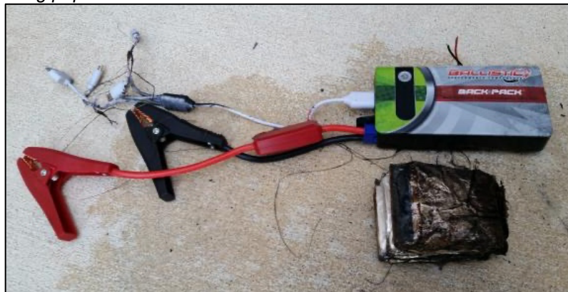
Figure 11. Damaged consumer items emit flammable and toxic fumes, as shown with this new versus burnt booster pack.