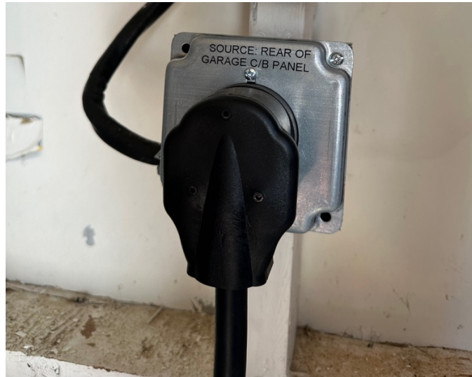
Figure 9. Home vehicle charging plug labeled for responders to know where to disable power.