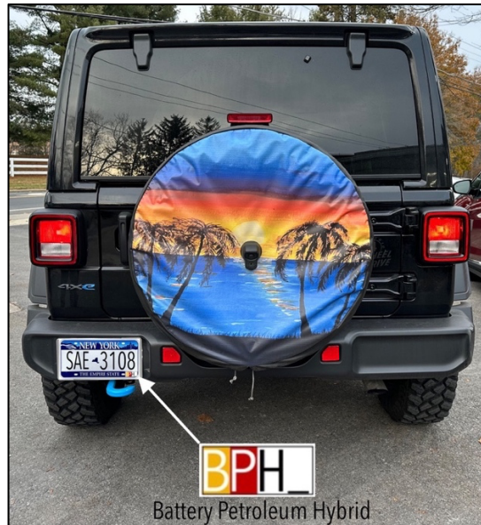
Figure 5. SAE J3108 license plate marking (sticker) for firefighter awareness about alternative fuels and power sources.