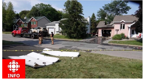
Figure 8. Ashburn VA after explosion launched garage door across street. Failure of charging car battery filled garage with explosive hydrogen, similar to failure of BESS systems.

Residential BESS systems also represent a potential asset in the ability to provide storage and buffer capabilities, such as during the summer when air conditioning demands are highest.