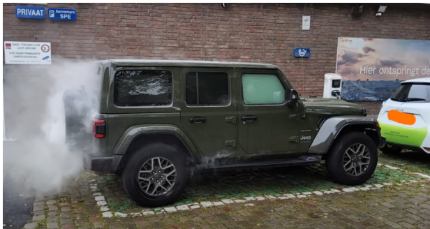
Figure 3. Jeep plug-in hybrid undergoing battery failure was hard to differentiate from non-hybrid Wranglers. The cabin was full of flammable vapors. (Belgium 10/30/23)