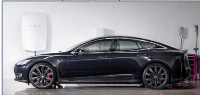
Figure 6. Garage Power Wall BESS visible above front of car.

An increasing number of residential houses with solar panel installations have an accompanying lithium-ion BESS or other battery back-up power system.