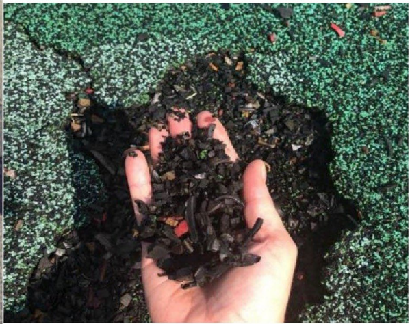
As unitary synthetic surfacing begins to age, it may deteriorate and expose the loose-fill cushioning layer underneath. This layer is typically made with shredded waste tires.