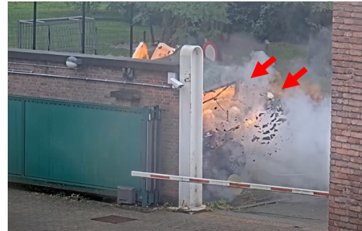
Figure 4. Jeep exploding after firefighters broke a window to ventilate the interior. Arrows point to firefighters caught in blast.