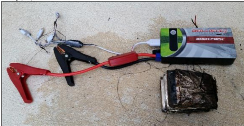
Figure 11. Damaged consumer items emit flammable and toxic fumes, as shown with this new versus burnt booster pack.