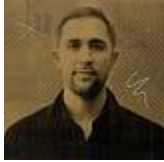
CHRISTOPHER F. RUFO

Harvard's embattled president quietly built "diversity" ideology into every facet of campus life.