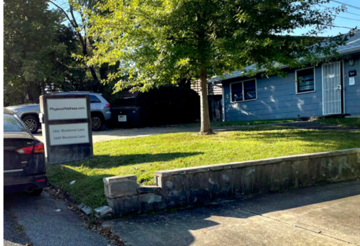
The actual house at the address for PhysicalAddress.com.

The person who answered the door one recent afternoon declined to identify themselves and said they could not confirm whether Wow Vegas used the address.