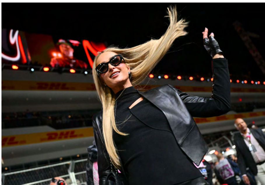
Paris Hilton, who endorses sweeps games, tours the grid before the start of the Las Vegas Formula One Grand Prix last year.

Seacrest is the ambassador for Chumba, while Phelps, DJ Khaled and NBA players Paul George and Karl-Anthony Towns have partnered with VGW's Global Poker brand. Drake is a celebrity endorser for Stake, which uses cryptocurrency in Canada but operates as a sweepstakes casino in the United States. Paris Hilton recently signed on to be the face of Wow Vegas. Her face is the only non-animated character on the casino's website.