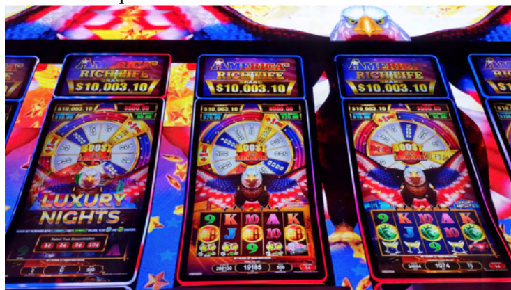
Leading games and systems developer showcases new releases aimed at championing winning moments