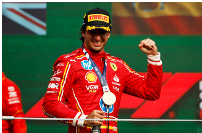
F1 driver Carlos Sainz is sponsored by VGW, the leader in social sweepstakes casinos.