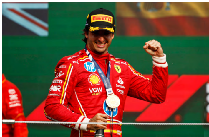
F1 driver Carlos Sainz is sponsored by VGW, the leader in social sweepstakes casinos.