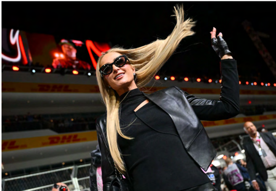
Paris Hilton, who endorses sweeps games, tours the grid before the start of the Las Vegas Formula One Grand Prix last year.

Seacrest is the ambassador for Chumba, while Phelps, DJ Khaled and NBA players Paul George and Karl-Anthony Towns have partnered with VGW's Global Poker brand. Drake is a celebrity endorser for Stake, which uses cryptocurrency in Canada but operates as a sweepstakes casino in the United States. Paris Hilton recently signed on to be the face of Wow Vegas. Her face is the only non-animated character on the casino's website.