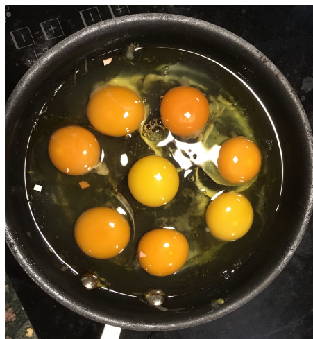
A variety of winter yolks, each hen having found slightly different forage.