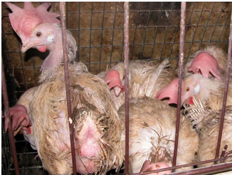
Cecilton, MD: birds crowded in a battery cage with severe feather loss