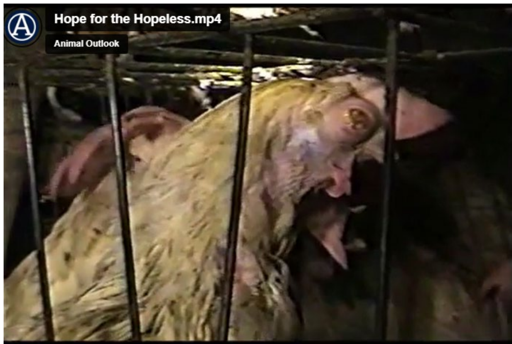
Cecilton, MD: Bird is seen with a severely swollen and infected eye