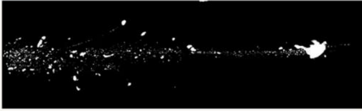
Traditional lead bullet fragmentation on entry