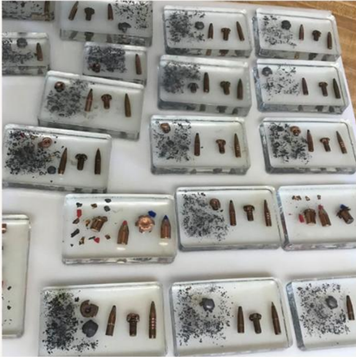
An assortment of lead bullets showing shot fracturing next to similar fired copper variants