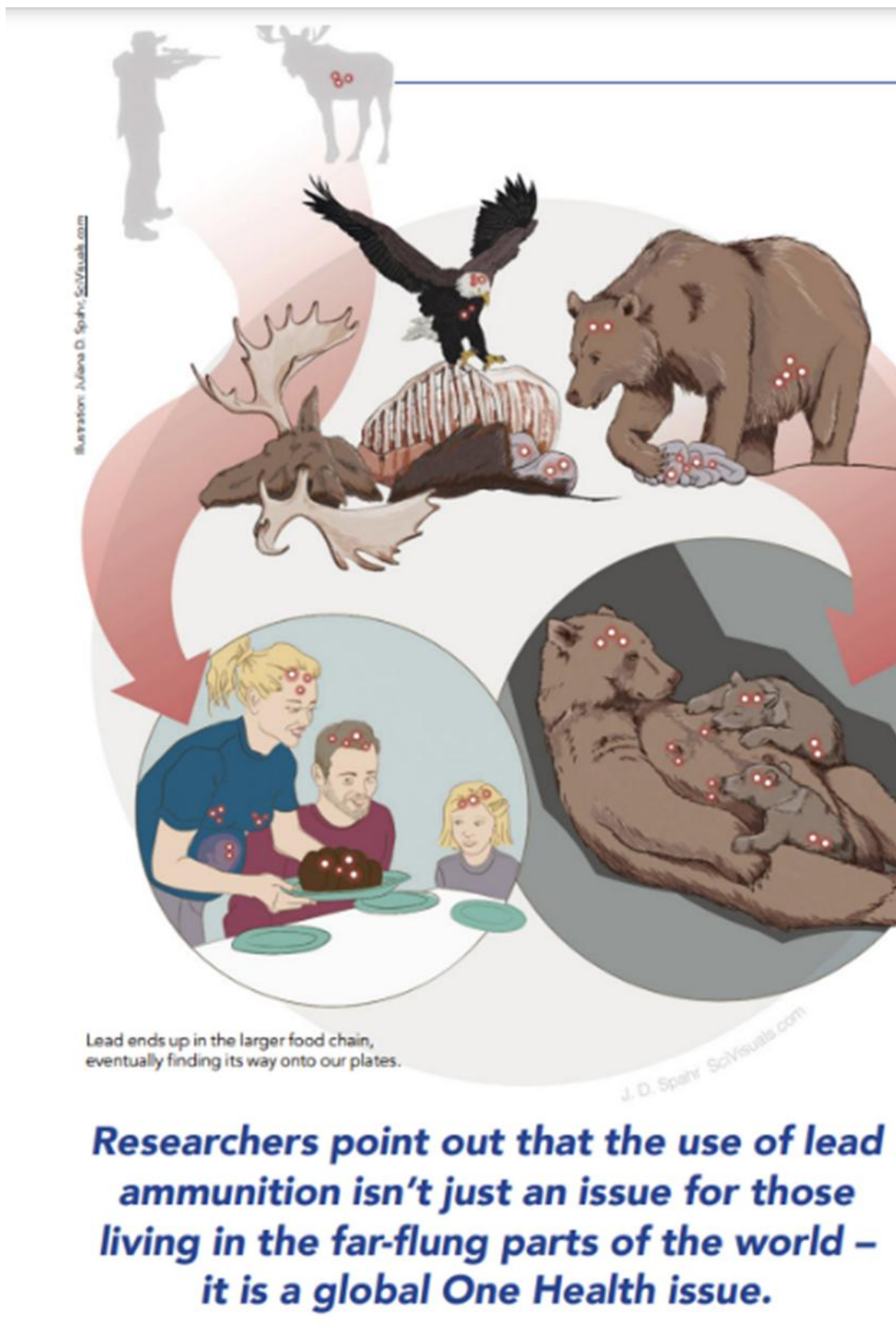
Figure from: Arnemo JM, 2022. "Lead ammunition used by hunters has us all in its sights." Outreach, Inland Norway University of Applied Sciences.

https://researchoutreach.org/wp-content/uploads/2023/06/Jon-M.-Arnemo_8em.pdf