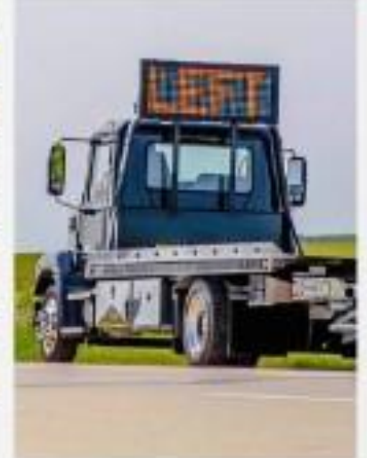
The 3-in-1 SafeAll Traffic Commander