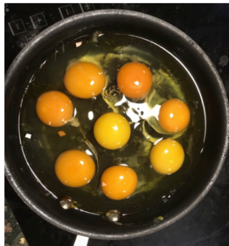
A variety of winter yolks, each hen having found slightly different forage.