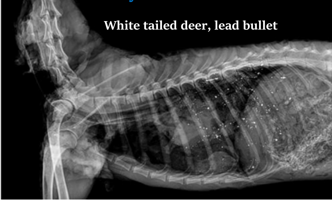
White tailed deer, lead bullet