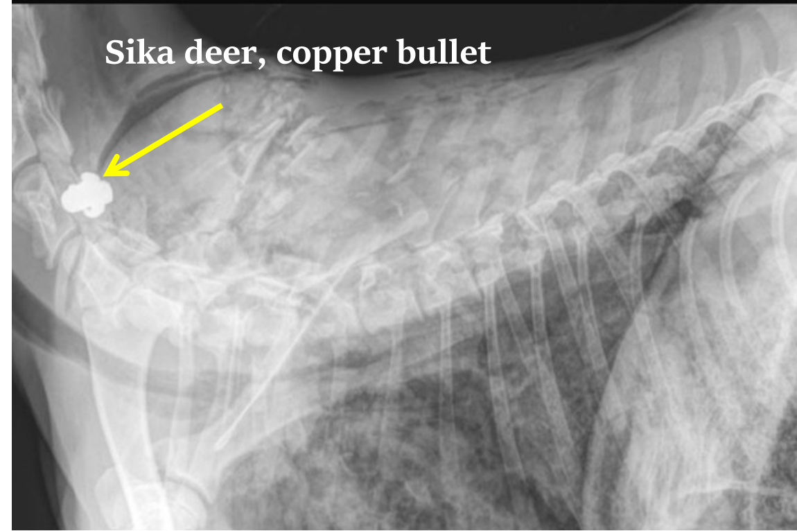
Sika deer, copper bullet