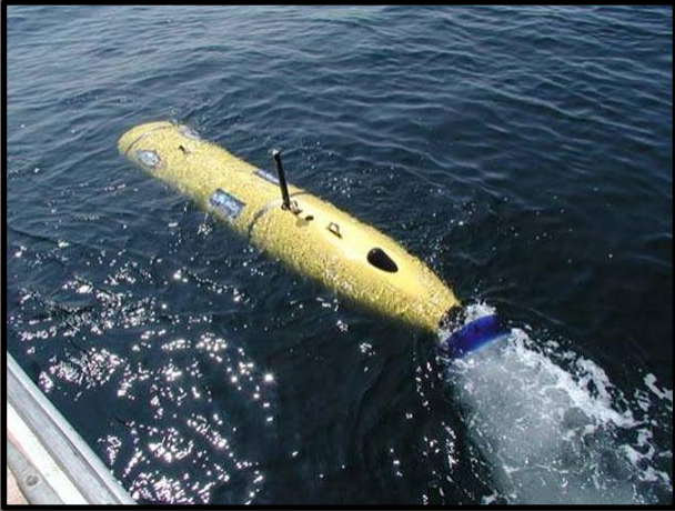
NOAA – Supported mine sweeping in Gulf.