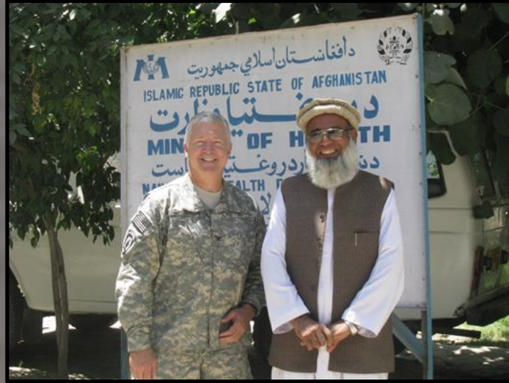
PHS – Deployed 100s to Iraq & Afghanistan conflict.