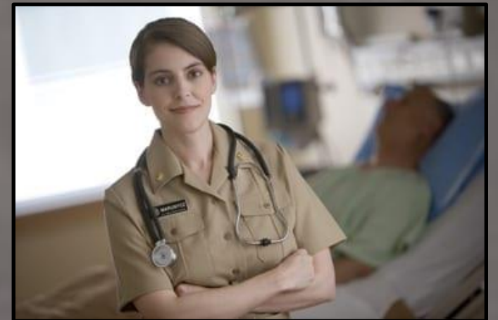
PHS – Deployed to Africa fighting Ebola