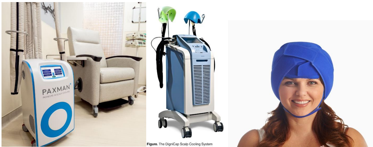
Figure. The DigniCap Scalp Cooling System