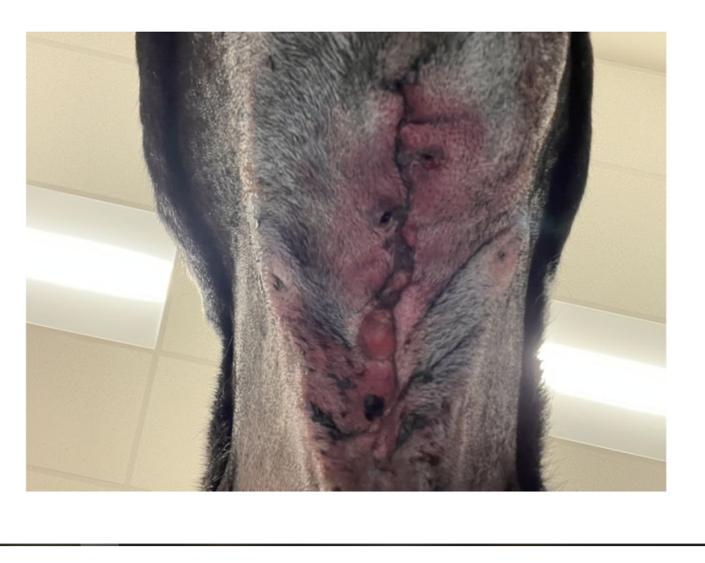
Photo of Andy's incision taken after discharge from clinic A and before admittance to clinic B

Photo of Andy's incision taken at discharge by clinic A on August \mathbf{28}^{th}