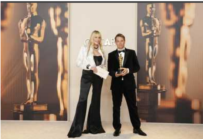
Oscars 2025: Here's a list of all the winners at the 97th Academy Awards