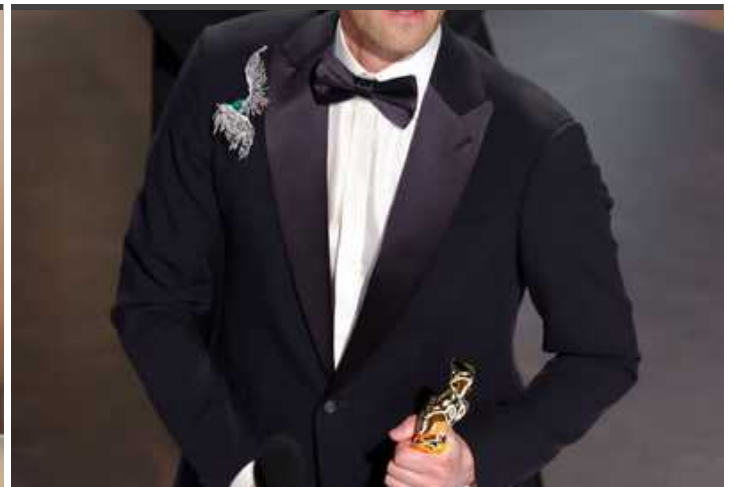
Adrien Brody claims second Best Actor Oscar for 'The Brutalist'

If you purchase something from the links on this page, we may earn a commission.