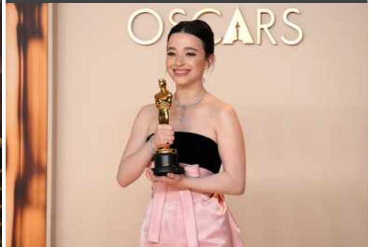
Mikey Madison wins Best Actress at the 97th Academy Awards