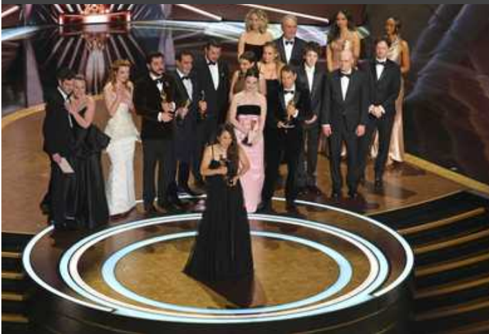
'Anora' wins best picture at 97th Academy Awards as director Sean Baker makes Oscars history