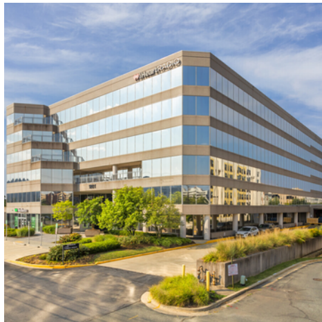
1801 Rockville Pike Rockville

Sold in 2024 for $14 million 30% below its 2024 assessed value of $22 million