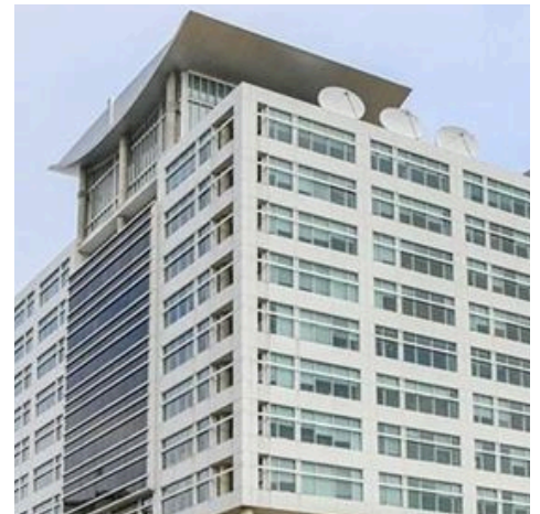
1 Inventa Place Silver Spring

Sold in 2018 for $70 million Assessed at $51 million in 2025