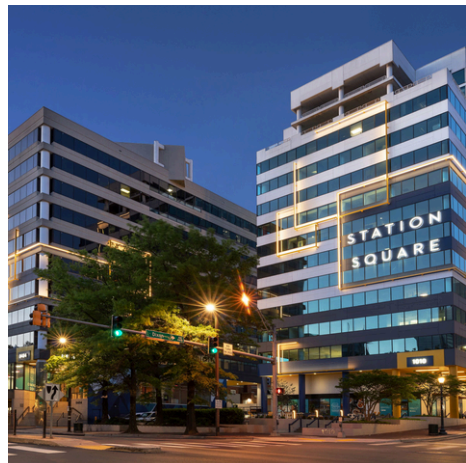
8484 Georgia Ave, 1010 & 1100 Wayne Ave Silver Spring

Assessed at $25-$35 million in 2025 Down $10 million from 2019