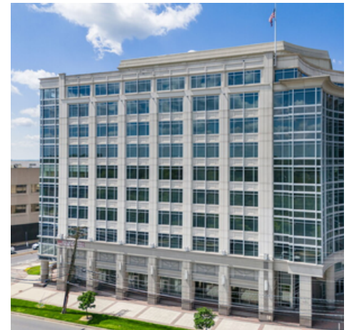
121 Rockville Pike Rockville

Auctioned for $10 million in 2024 60% below its $26 million assessed value