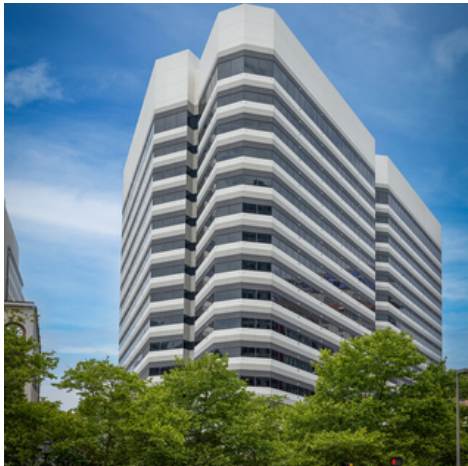
7500 Old Georgetown Road Bethesda

Sold in 2024 for $30 million Down 78% from its high of $133.8M