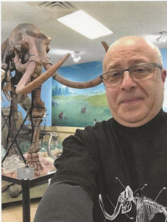
Fig. 1. Here I am at NHSM's Mammoth exhibit in 2024.