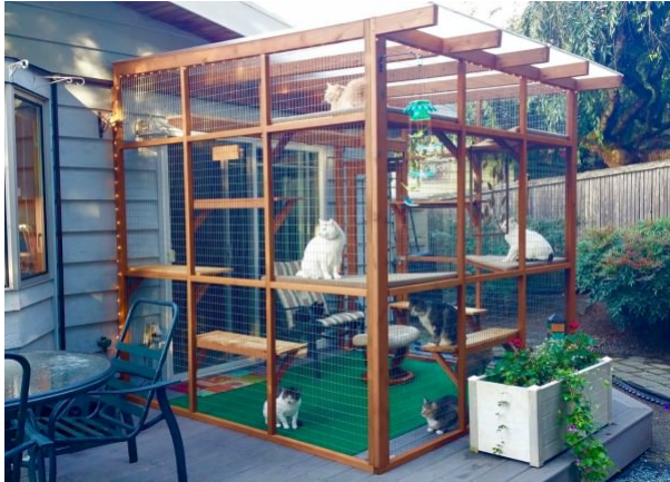
Catio enclosure attached to a residence