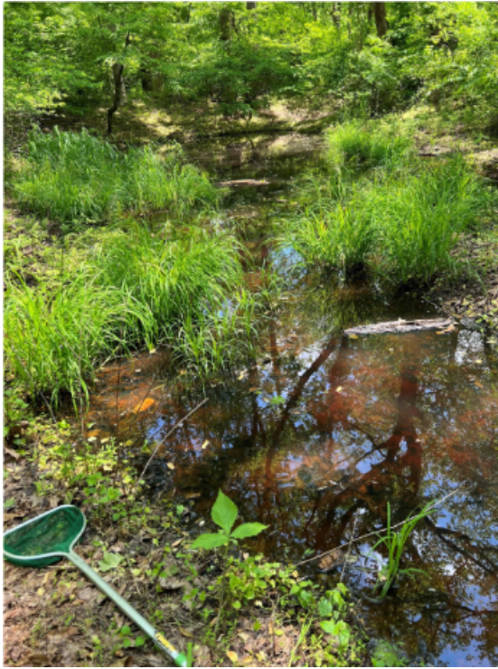
Figure 3: Vernal pool formed from an old farm pond