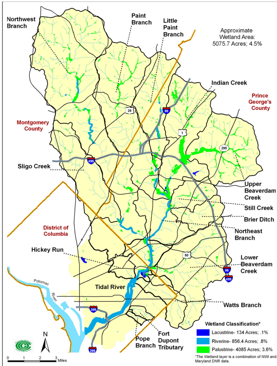
Map 1: Wetland Classifications within the Anacostia Watershed

Vernal pools are a unique type of wetland in the state of Maryland. Though often small and seasonal, they play a vital role in the ecosystem. These temporary wetlands provide essential breeding habitats for a variety of amphibians, including species such as wood frogs and a group of salamanders known as mole salamanders. The mole salamander family is unique to North America (including the famous axolotl) and includes species such as the Eastern tiger salamander (an endangered species in Maryland), Jefferson salamander (a vulnerable species in Maryland), Spotted salamander, and Marbled salamander. The latter two are present in the Anacostia River watershed, and we are currently evaluating their presence in our watershed for purposes of conservation planning. Many species like these cannot reproduce outside of vernal