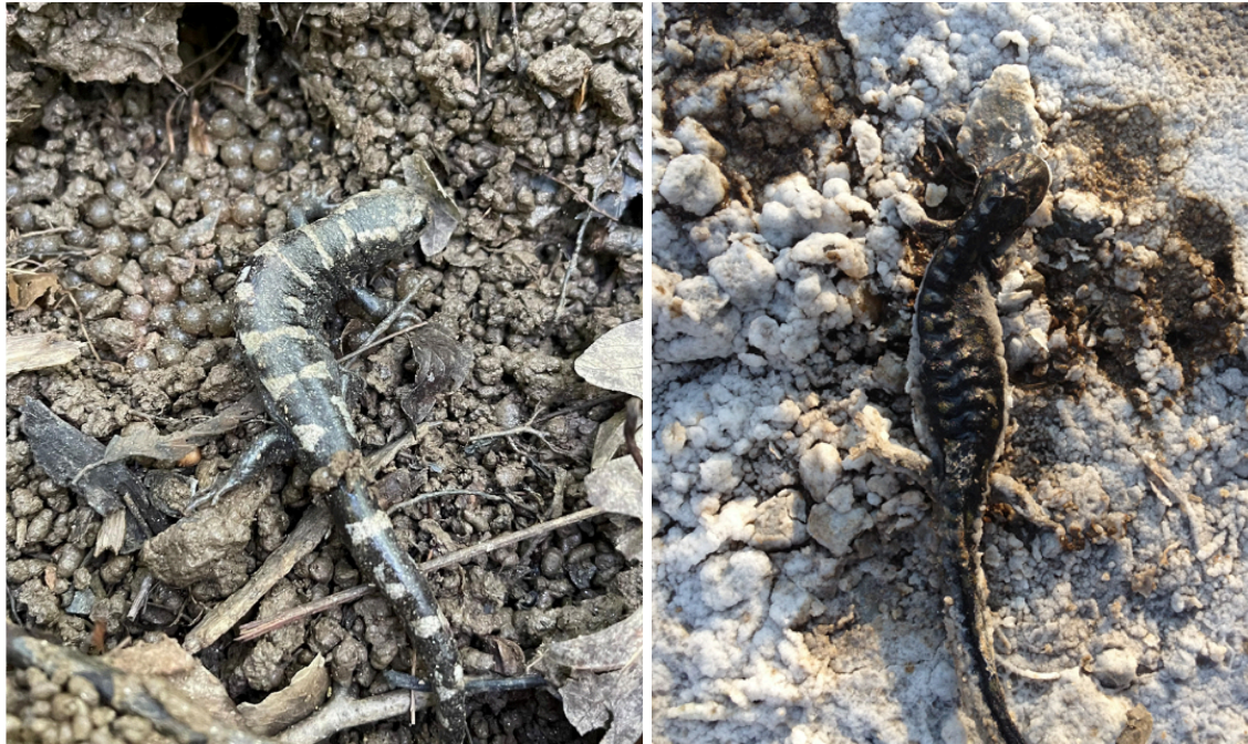
Figure 1: A marbled salamander alive in a vernal pool habitat. To the right is a dead salamander due to unnecessary salt application.

pools. Consequently, the loss of vernal pools and their dependent amphibian and invertebrate species would go hand in hand. These ecosystems support biodiversity and contribute significantly to the health of Maryland landscapes and natural heritage.