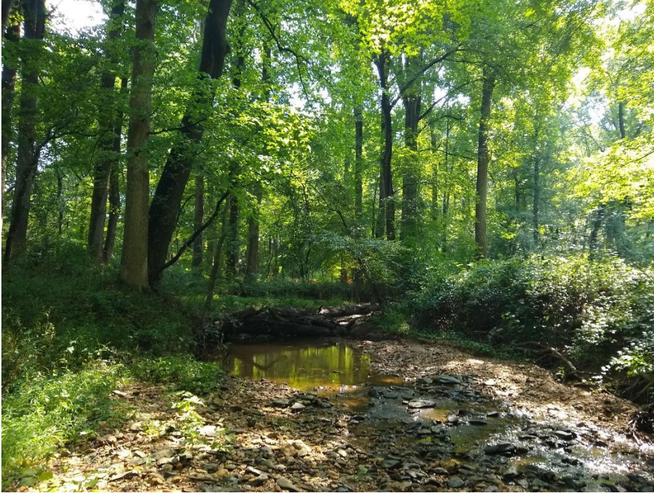
7-view upstream at trail crossing 2021