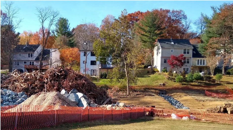
12-view to south Nov 2021