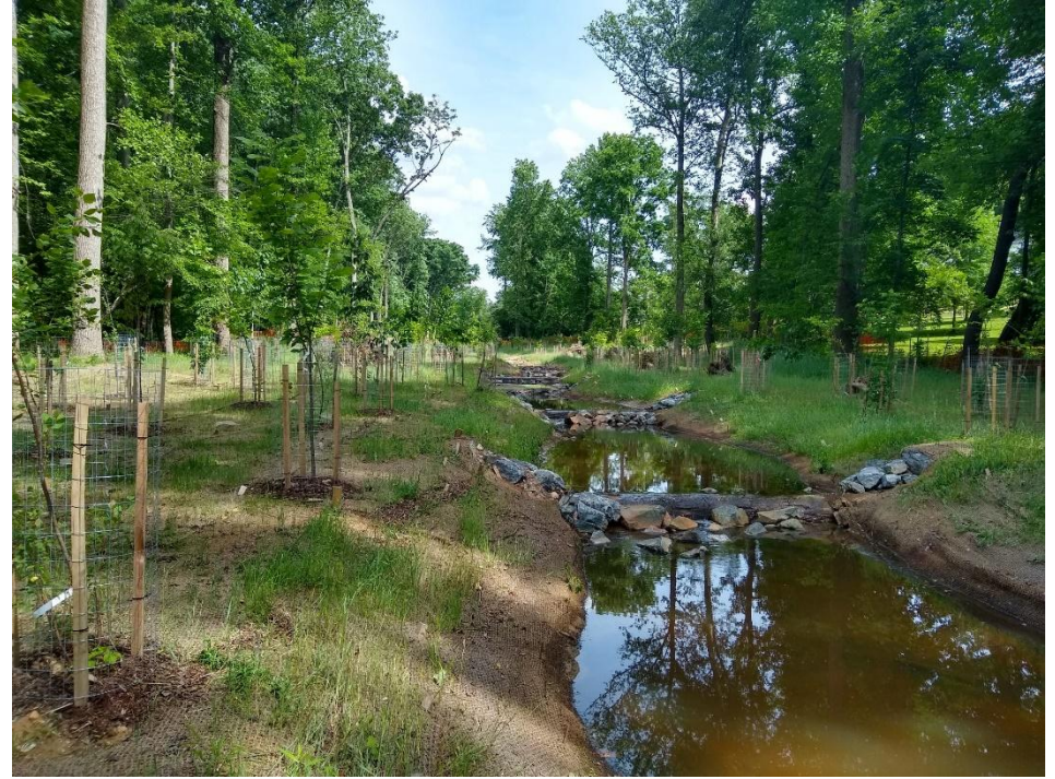
8-view upstream at trail crossing 2022