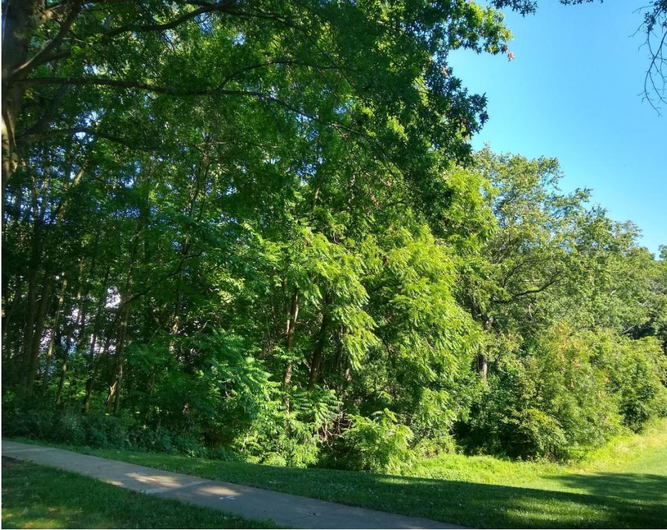
1- View from Solitaire Court 2021