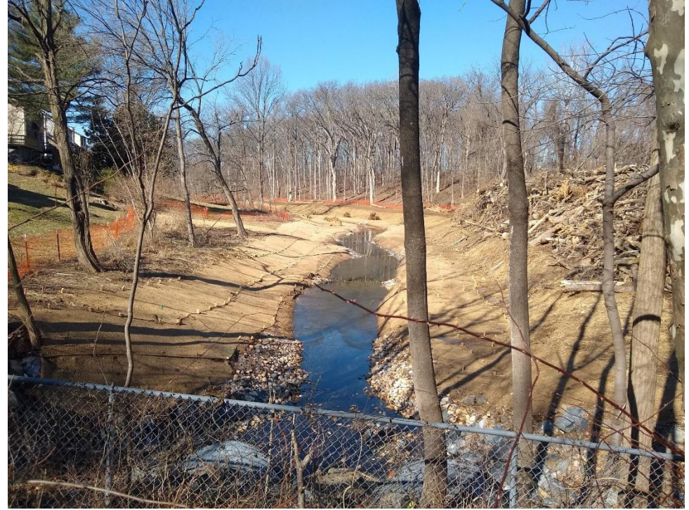
10- view downstream from road 2022