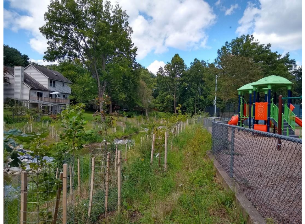
6-Playground on right bank 2022