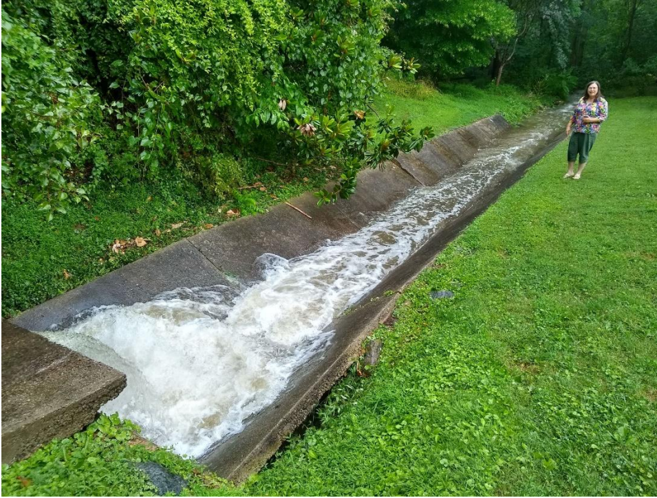
16- Untreated stormwater discharge from Diamond Drive to the stream at the downstream terminus of the project, 2021.