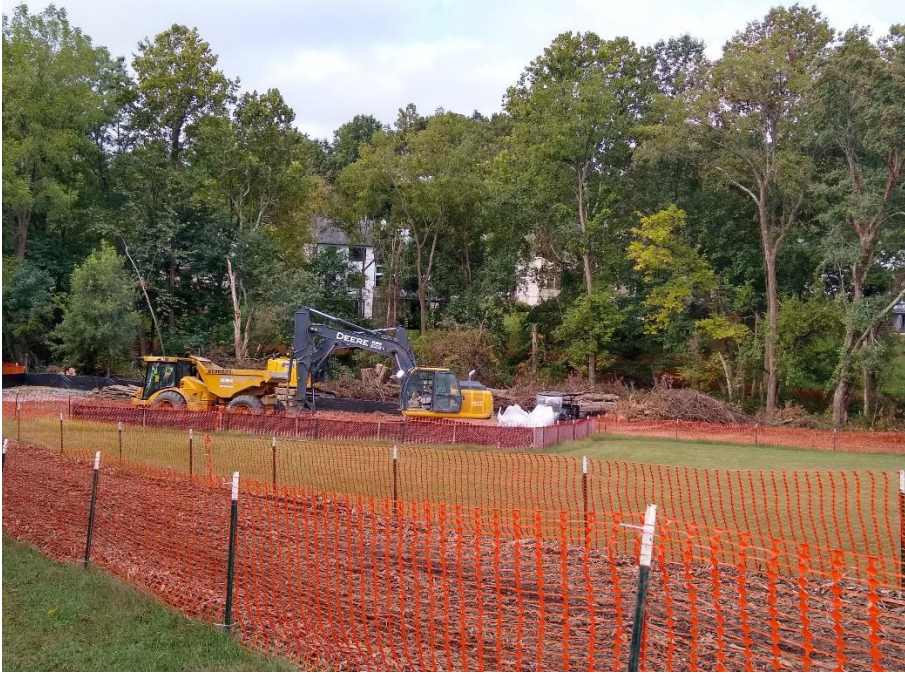
11-view to south Oct 2021