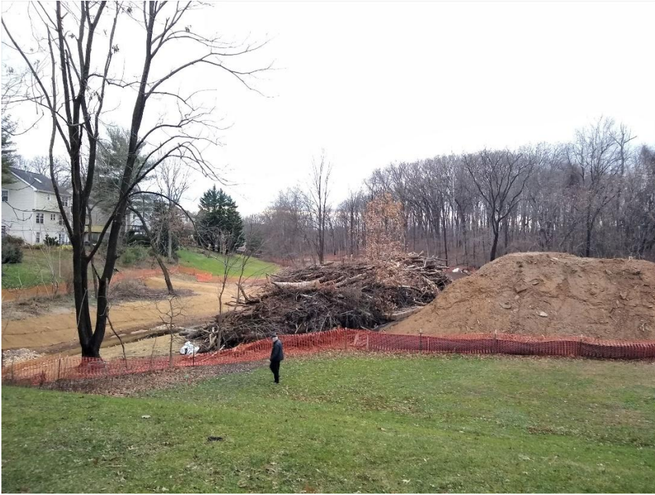
14-Slash piles 2022