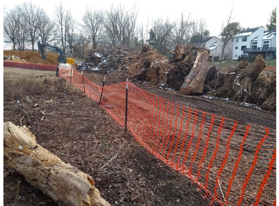
13-view to south Jan 2022