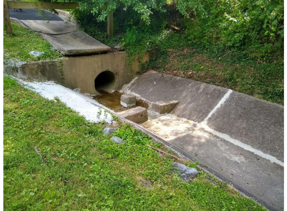
17- The same discharge channel. This problem was not included in the stream reconstruction (restoration) project and remains unaddressed in 2023.