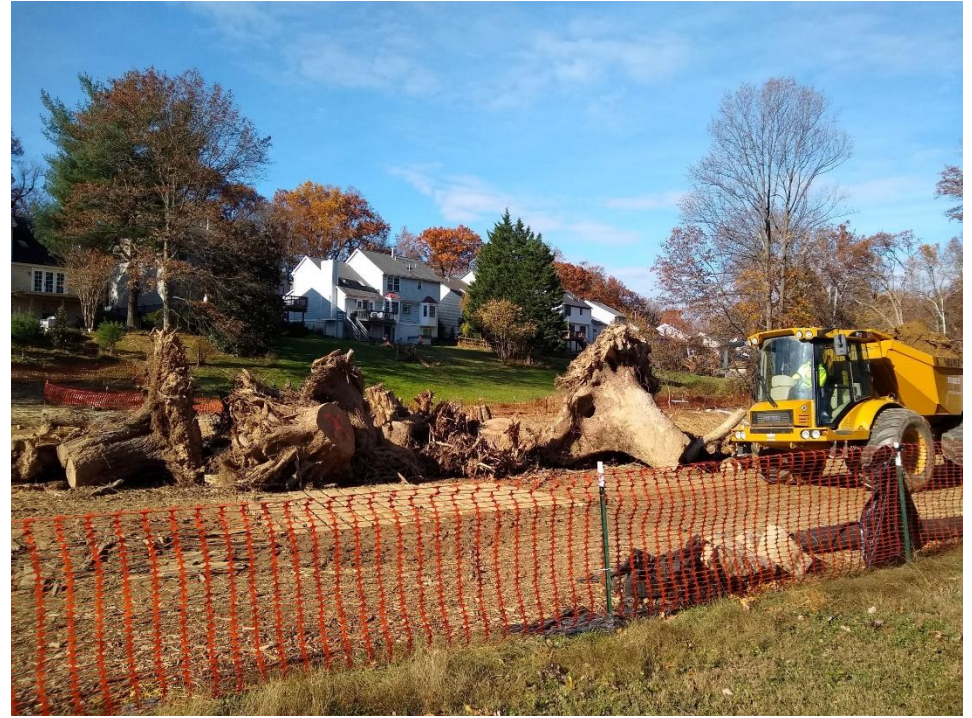
15-stumps w excavator Nov 2021