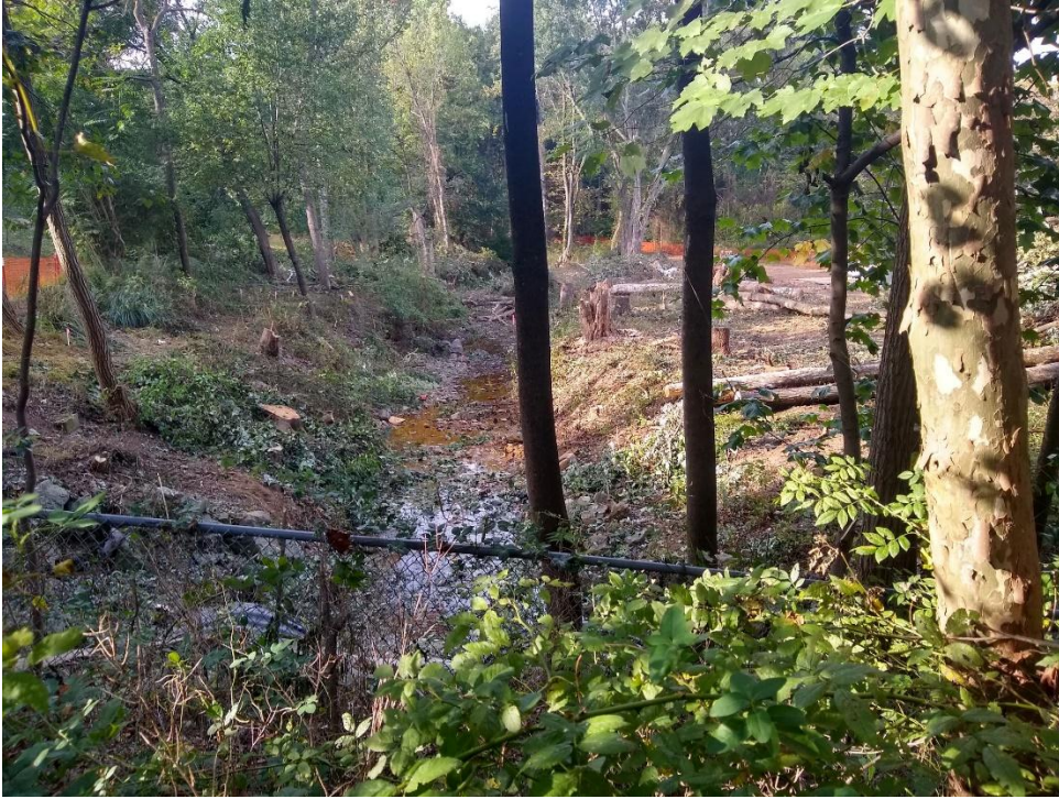
9- view downstream from road 2021