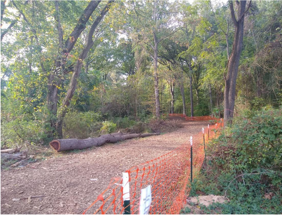
3- Construction access 2021