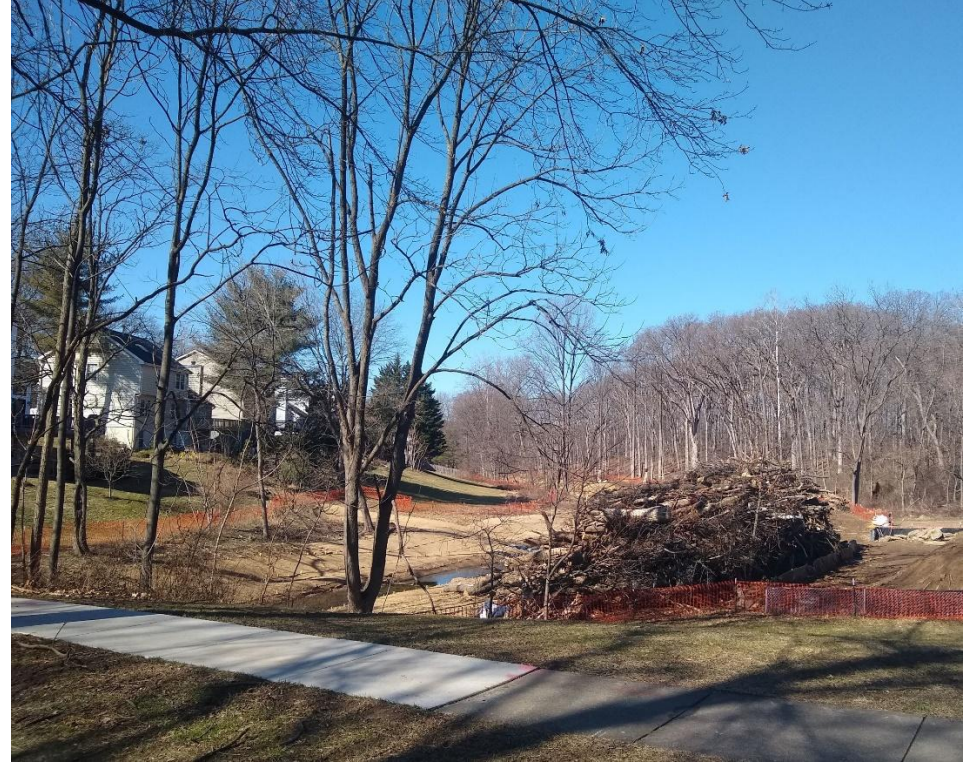
2- View from Solitaire Court 2022