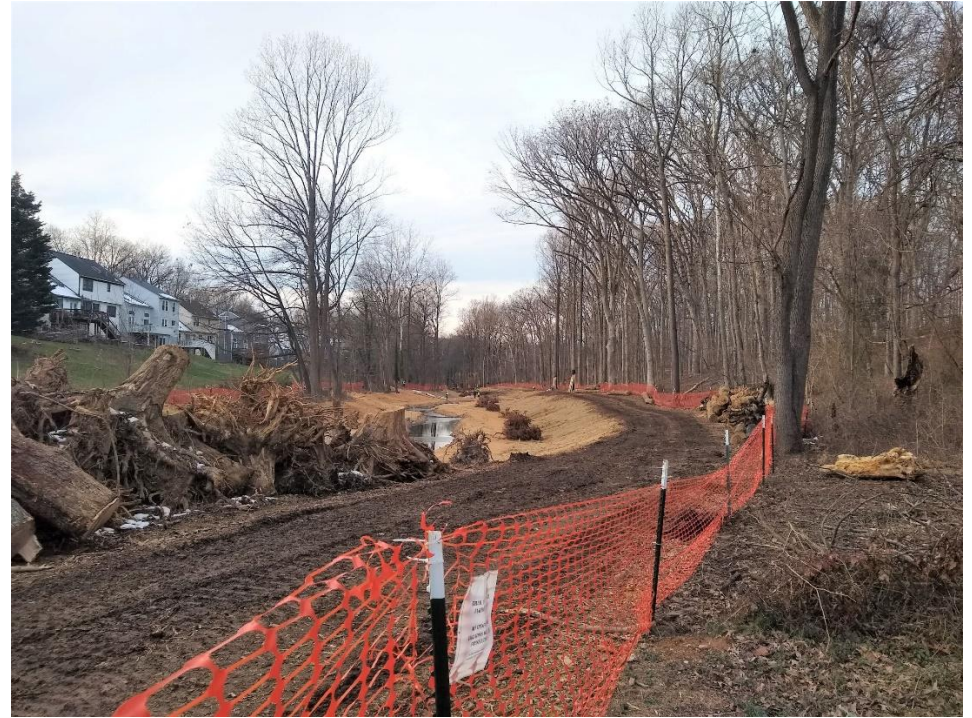
4- Construction access 2022