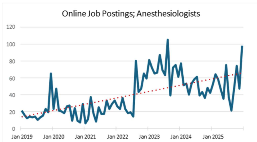
Chart: Online Job Postings for Anesthesiologists in Maryland; Jan 2019 to Dec 2025

Employment data shows a decline for Anesthesiologists from 2019 to 2025. Online job posting data shows the opposite. From Jan 2019 to Dec 2025, job postings for Anesthesiologists have increased 367%. This could indicate that the decline in employment/workers for Anesthesiologists resulted in a shortage. The surge in online job postings could indicate employers trying to hire due to the increased need for Anesthesiologists.