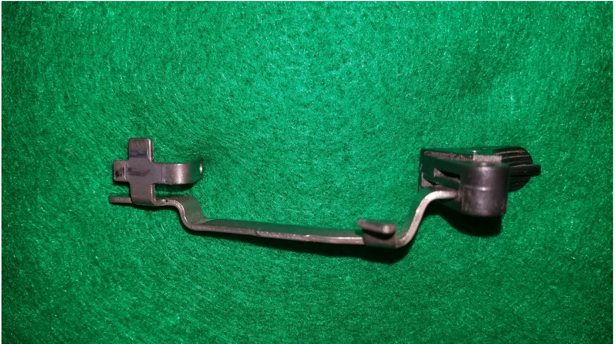
Glock Cruciform Trigger Bar Assembly – Top View