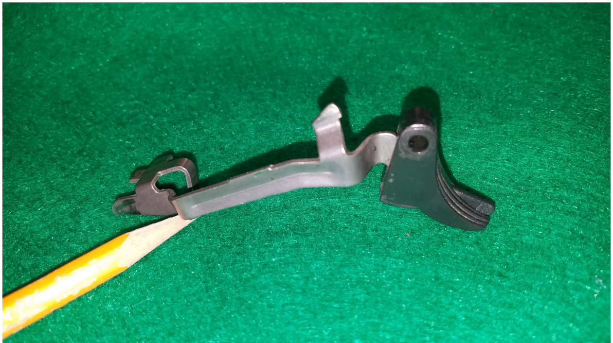
Glock Cruciform Trigger Bar Assembly – Side View